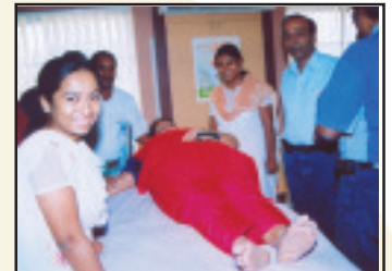
Blood Donation camp by Rotaract Club