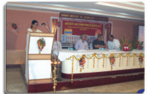
Inaugural Function of Anarghya-08