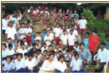
NCC Cadet are with the blind students on the eve of NCC day Celebration.

Members of Synergy Rotaract Club organized the blood donation camp on dated in which more than 160 units of blood have been donated.